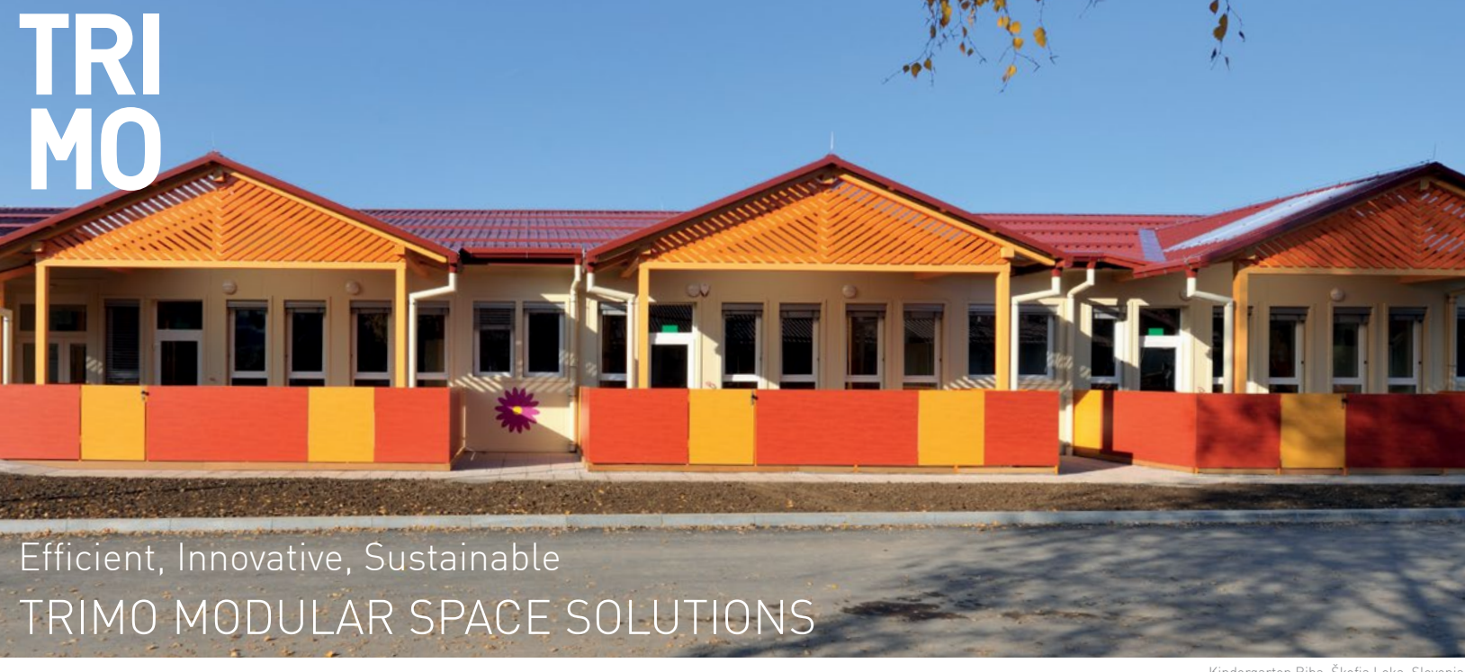
Kindergarten Biba, Škofja Loka, Slovenia